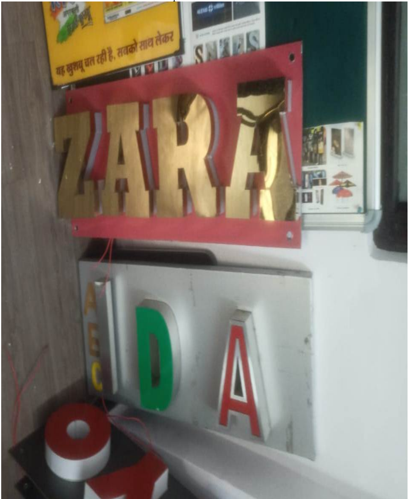
Sample of Letter