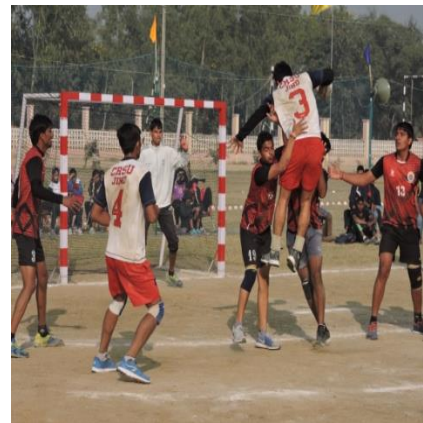
The players of CRSU know their target with precision–The Handball players of University in action during North Zone Inter University Handball Championship held at University Campus. The CRSU bagged the first position both in Men & Women