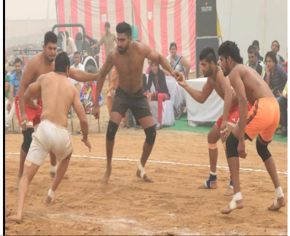
Determined to defeat rival - the Women and Men Kabaddi players in action during Inter University Circle Kabaddi tournament at CRSU.

The University annually organizes Athletic Meet. Recently, the third Athletic Meet was organized in which a number of teams from affiliated colleges and UTDs participated.