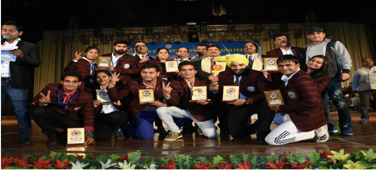
The University team in a jubilant mood after securing 2 nd position in North Zone Inter University Youth Festival at Kanpur

In the history of Haryana, a State Youth Festival of Colleges of Education – “Aagaaz” inaugurated by Hon’ble Governor & Chancellor of the University was organized by CRSU for the first time in the month of Feb, 2017.