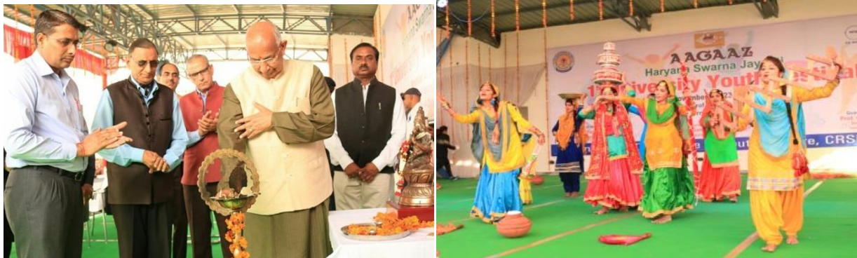
Hon’ble Governor & Chancellor of the University while inaugurating 1 st University Youth Festival “Aagaaz” and the students performing on the stage

In the history of Haryana, a State Youth Festival of Colleges of Education – “Aagaaz” inaugurated by Hon’ble Governor & Chancellor of the University was organized by CRSU for the first time in the month of Feb, 2017.