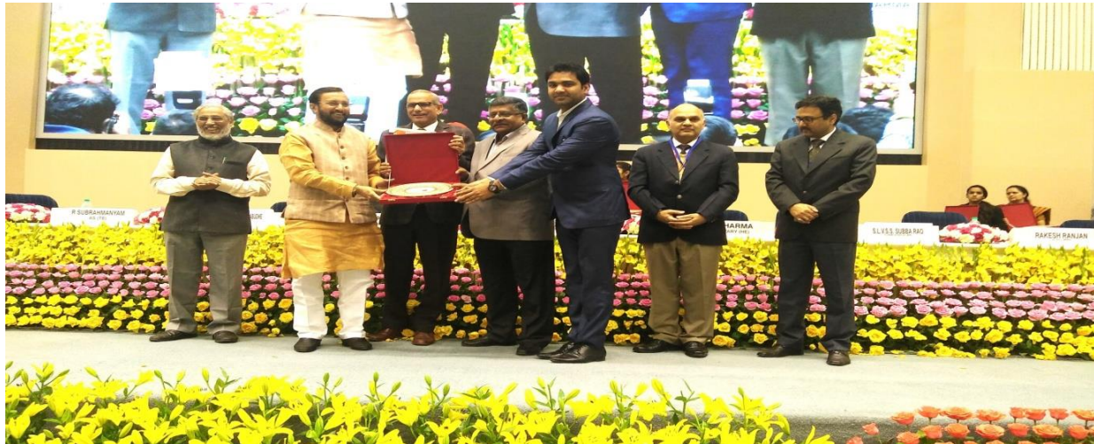
Hon'ble HRD Minister, Govt. of India conferring award to CRSU on “ Vitiya Shaksharta Abhiyan ”

It is a matter of great pride that CRS University has achieved the distinction of being the first state university of Haryana with 100% biometric attendance plus the leading digital state university of Haryana with 14 th Rank among the state universities promoting cashless transactions as per the vision of Hon'ble Prime Minister. In recognition to these achievements,