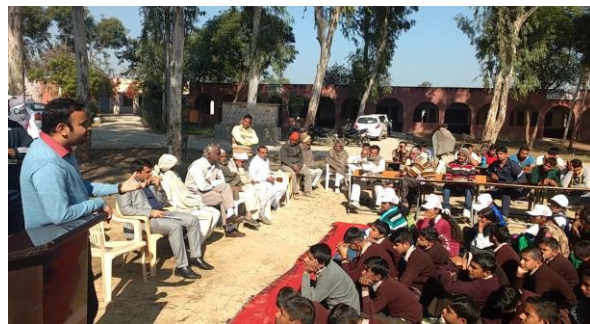
University teachers generating awareness among school children and villagers about adopting the practice of cashless