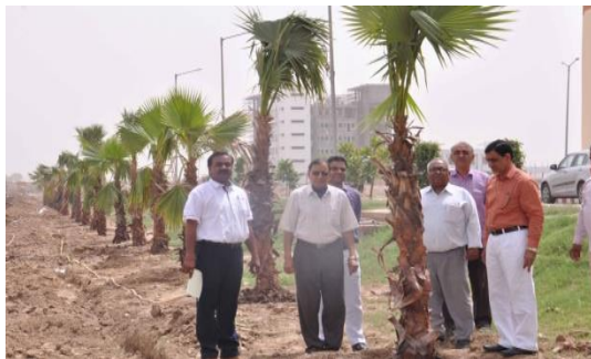
The University on Green Mission – A tree Plantation drive was inaugurated by the Vice Chancellor.

Albeit the university is situated in backward and rural vicinity where 80% students belong to rural areas and about 50% of the enrolled students are offered financial support in the form of fee concessions, and cash prizes etc. Since 2014 to date, the V.C. and his faculty has visited 307 villages to help the villagers to maintain cleanliness, stop female feticide, practice cashless transactions, value education, digital India, Yoga and tree plantation to keep the environment safe and healthy. In addition, to realize the vision of Hon'ble Sh. APJ Abdul Kalam, Former President of India for a clean and green India, the university has started green campus drive under the able and dynamic leadership of its Vice-Chancellor.