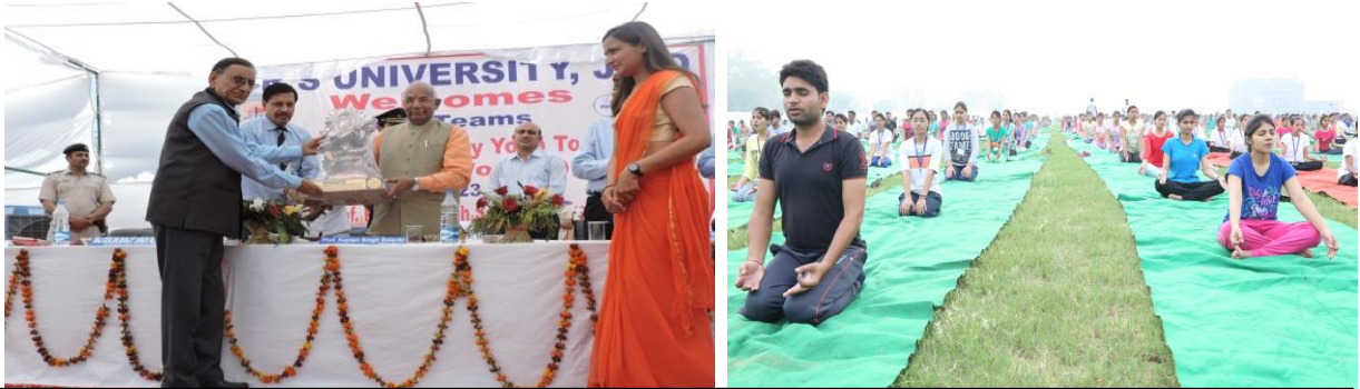
Vice Chancellor honoring the Hon'ble Governor & Chancellor of the University and students observing Yoga day on the occasion of All India Inter University Yoga Championship by presenting a Memento.

performed yoga in action. The N.S.S volunteers of the University in tandem with local administration undertook a “Swachh Bharat Abhiyan” as per the vision of the Prime Minister by launching the mission Rani Talab (5 centuries old ancient historical monument) cleanliness campaign. These are some of the achievements of CRSU who within a short span of less than three years has made its mark in different fields like academics, sports, cultural and society.