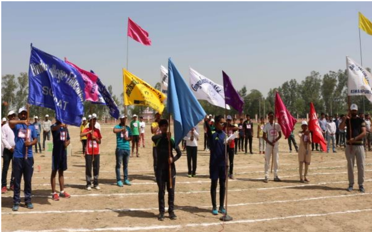
Third Annual Athletic Meet being held in the campus with the participation of affiliated Colleges of Education in their colorful garbs.

The University annually organizes Athletic Meet. Recently, the third Athletic Meet was organized in which a number of teams from affiliated colleges and UTDs participated.