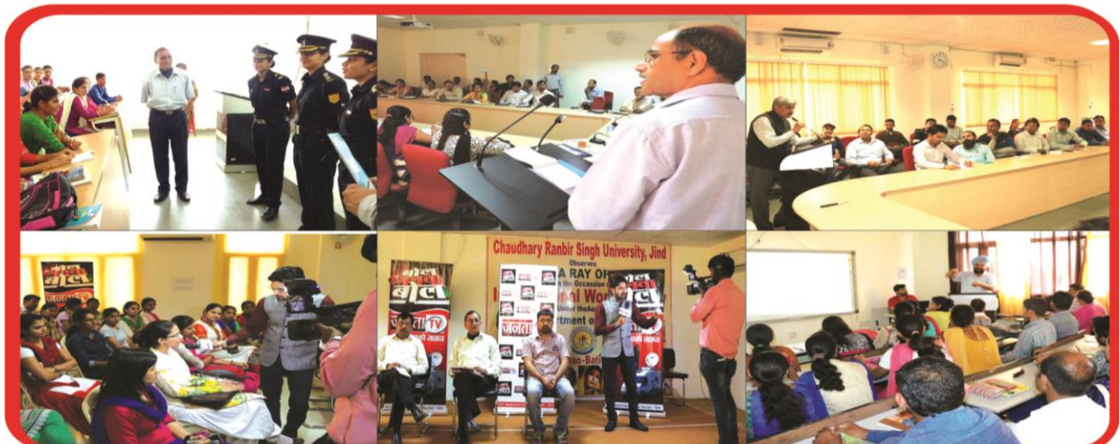
Women Army officers, Media persons and Resource persons interacting with the students of the University

As per the UGC guidelines, the University has introduced the semester system, credit system and continuous and comprehensive evaluation alongwith the choice based credit system in all its Academic programmes on the campus. The yoga education has been made a compulsory subject in the University curriculum. The International Yoga Day was observed by the University on 21 June, 2016 in the campus in which 15000 students, faculty members of CRSU and other affiliated Colleges of Education led by the Vice Chancellor participated and