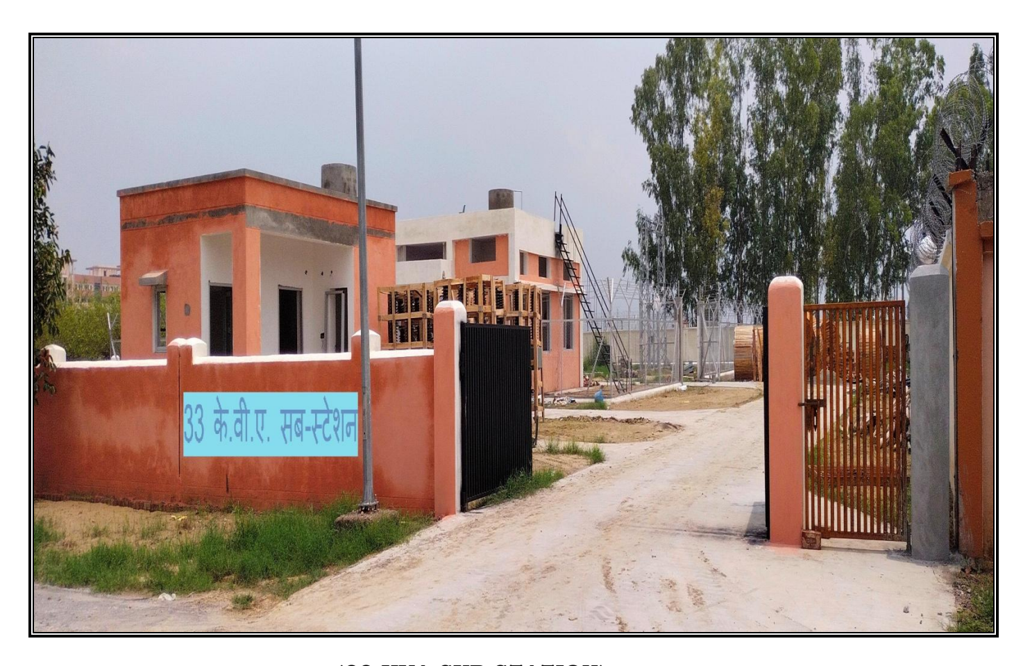
(33 KVA SUB-STATION)