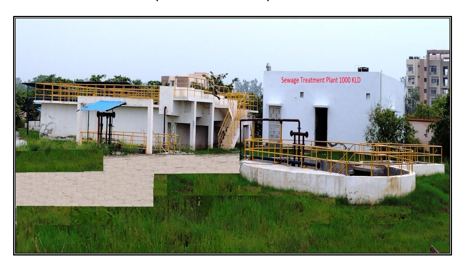
(SEWAGE TREATMENT PLANT)