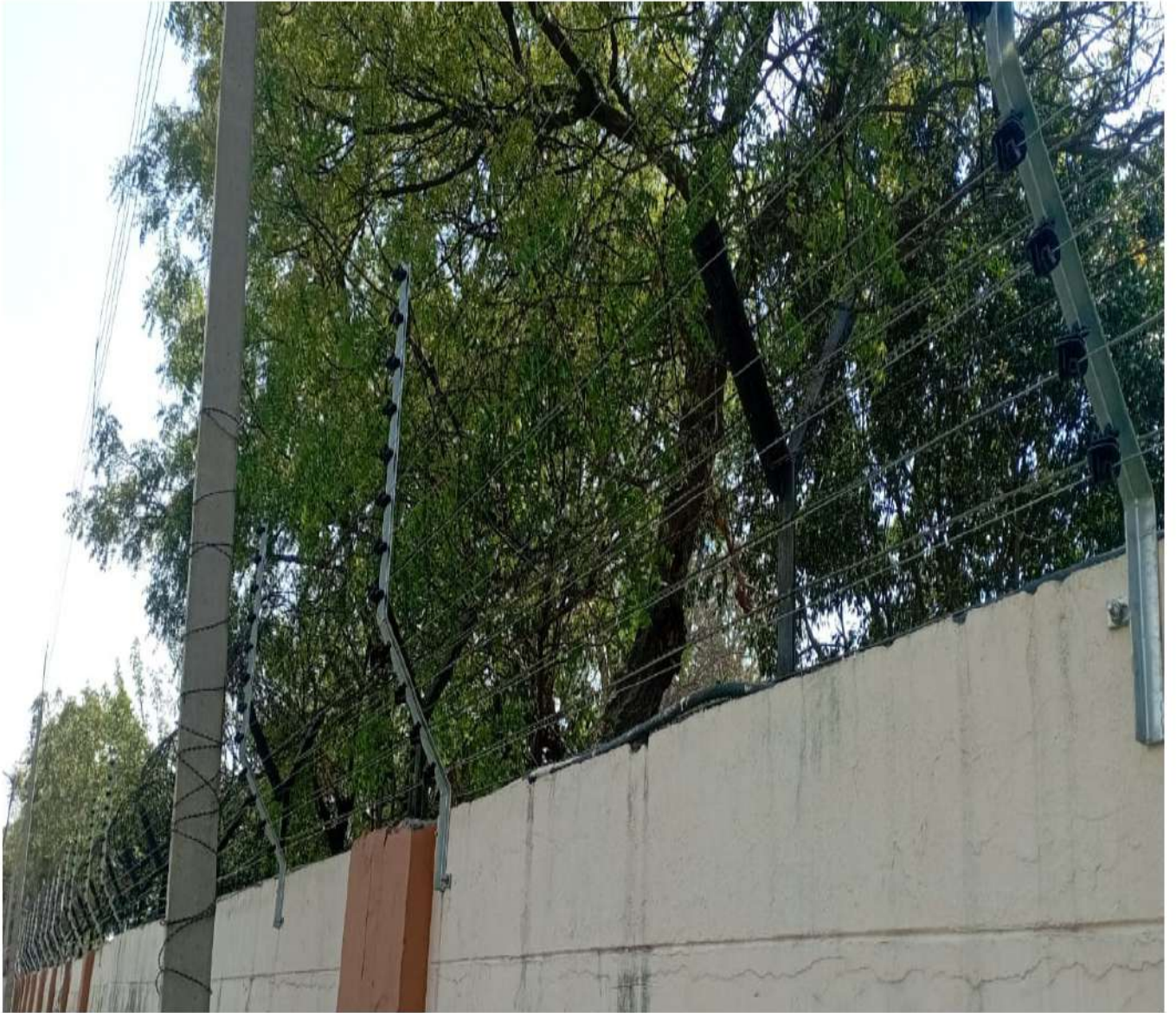
Existing wire fencing Image for Reference